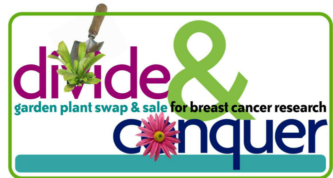
Logo for community fundraising event with proceeds to support Princess Margaret Hospital