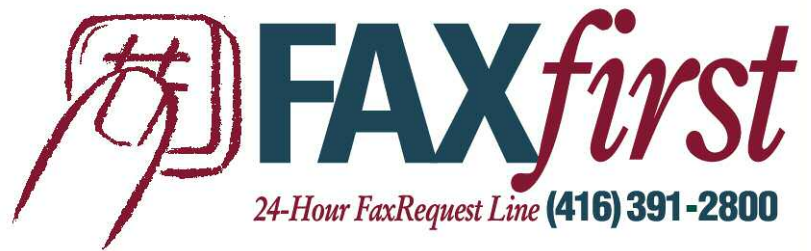
Logo for Fax-on-Demand service provider.