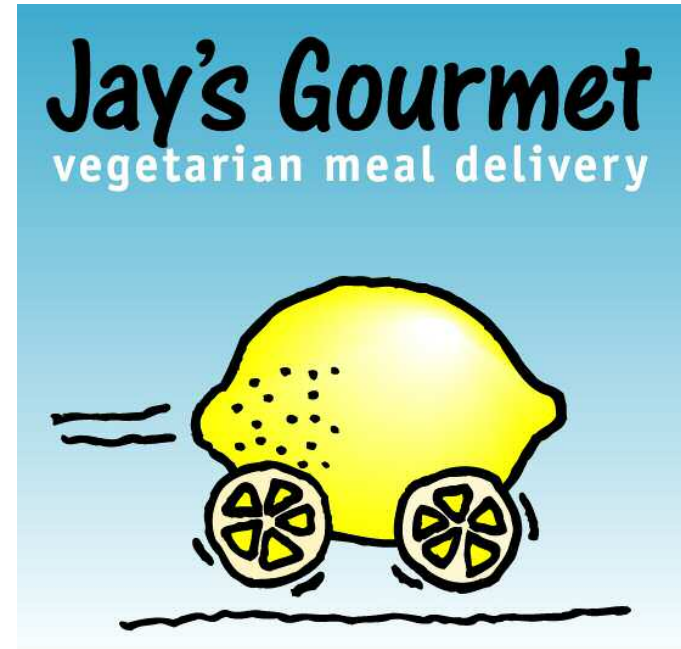
Logo for a catering company that delivers vegetarian meals to homes across Toronto.