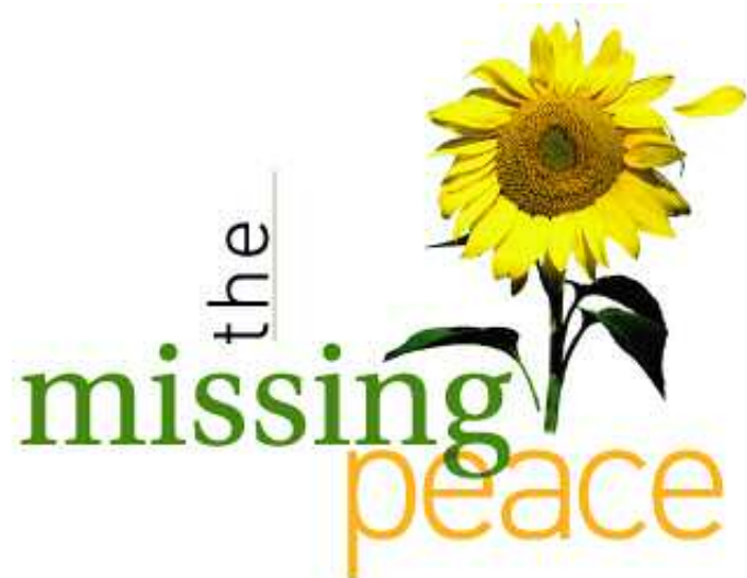
Logo for holistic nutritional consultant.