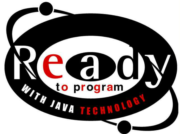
Logo for software textbook publishers.