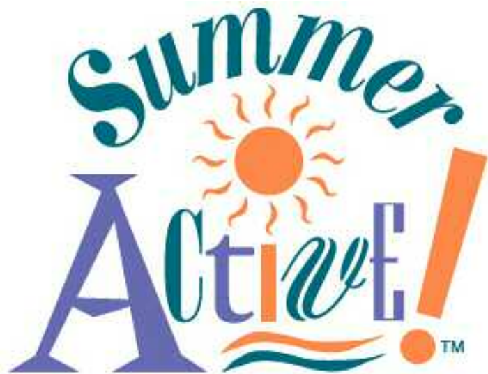
Logo for SummerActive/ParticipAction – a 2 week initiative to promote healthy active living.