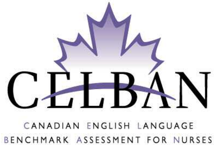
Logo for Assessment Tool for the Centre for Canadian Language Benchmarks.