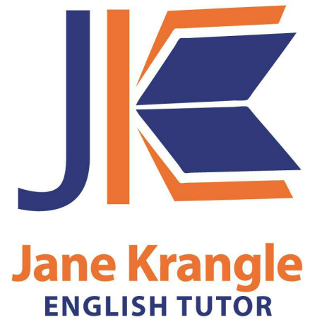
Logo for tutor providing services for foreign students.